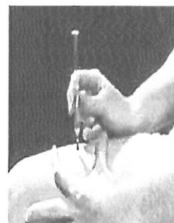
Steps 8-10 Hold the syringe like a dart, spread the skin pushing down slightly, and dart the needle into the thigh at a 90 degree angle.