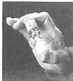
Steps 2-3 Mix the medication and shake the vial.