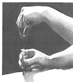
Step 11 Pull back the plunger to check for blood.