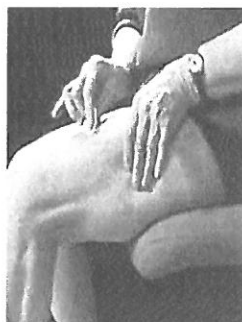
Steps 6-7 Select the site for injection and use the alcohol to clean the skin.