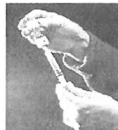
Steps 4-5 Insert the needle into the vial and draw up the medication.