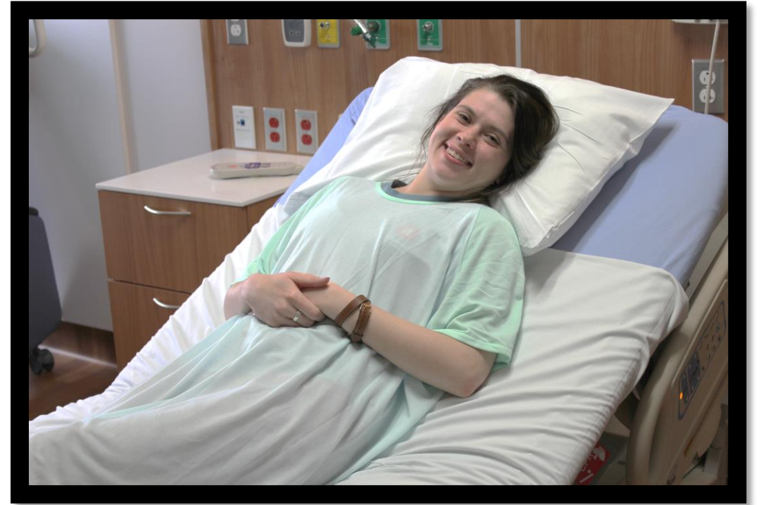
Today I am going to have a straight cath.

A straight cath is a bendy tube that will help remove urine, or my pee, from my bladder.