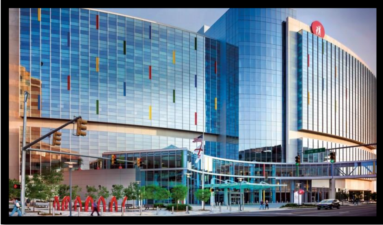
I am at the hospital today.