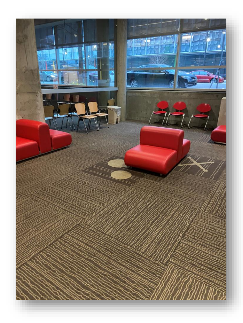
I will wait calmly in the waiting room.