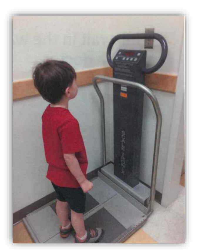
When my name is called, my family and I will walk with the nurse to check my weight.