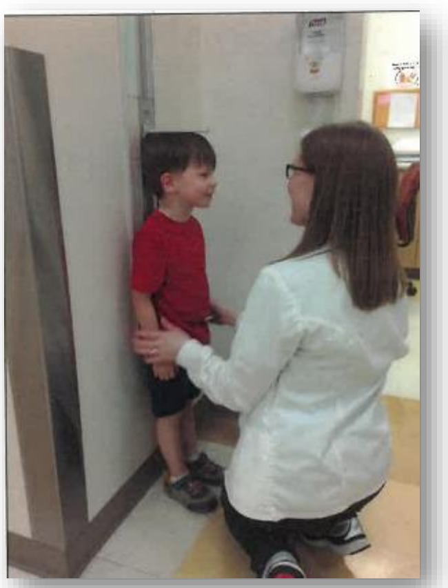
The nurse will check how tall I am.