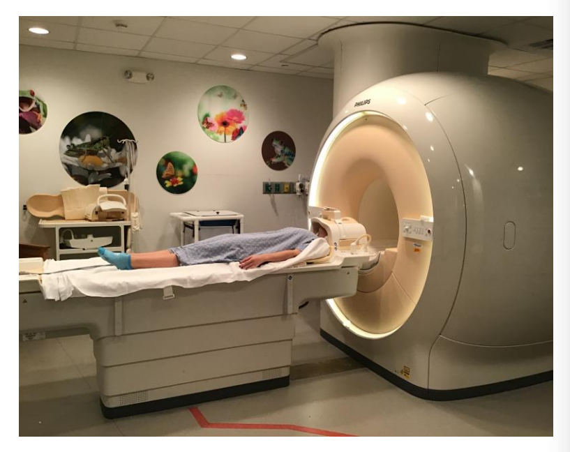
I will lie on this table.

I will have a coil (like a helmet or turtle shell) over the part of my body that needs pictures.