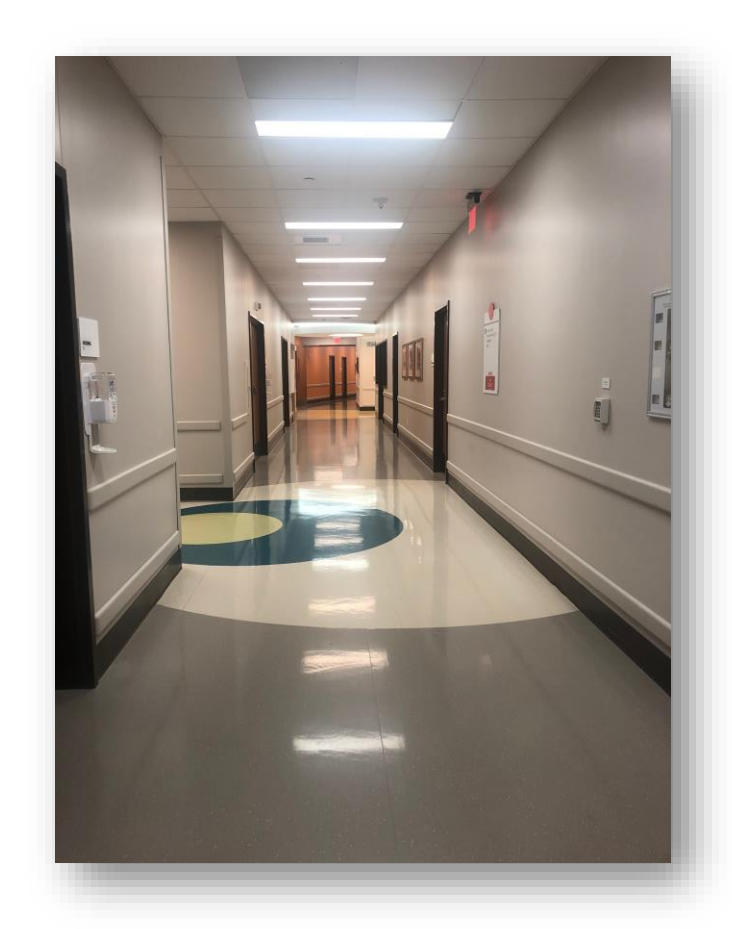
My family and I will walk down the hall.