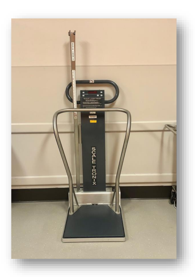
I will step on the scale to see how much I weigh.