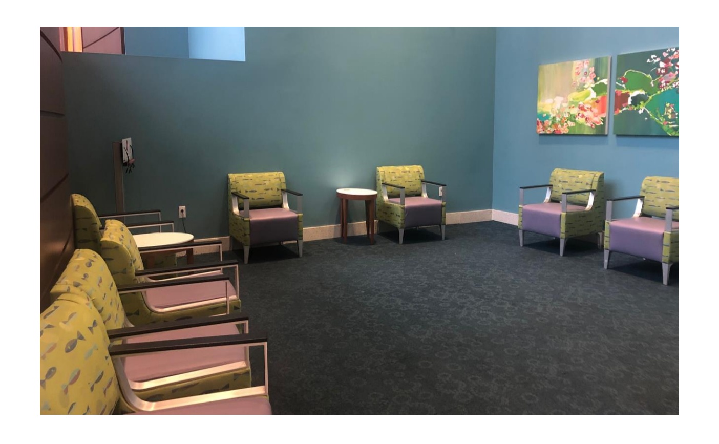
My family and I will wait in this room.

A nurse or MRI technologist will come get me when it's time for my MRI.