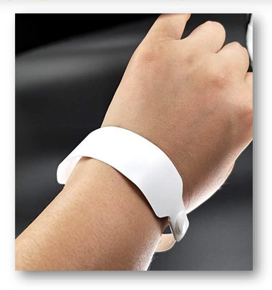
I will receive a bracelet with my name on it.

It is important that I wear it on my wrist.