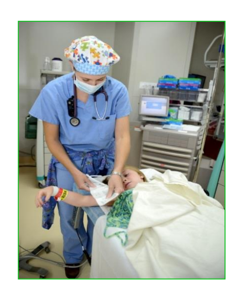
Put a blood pressure cuff on my arm.