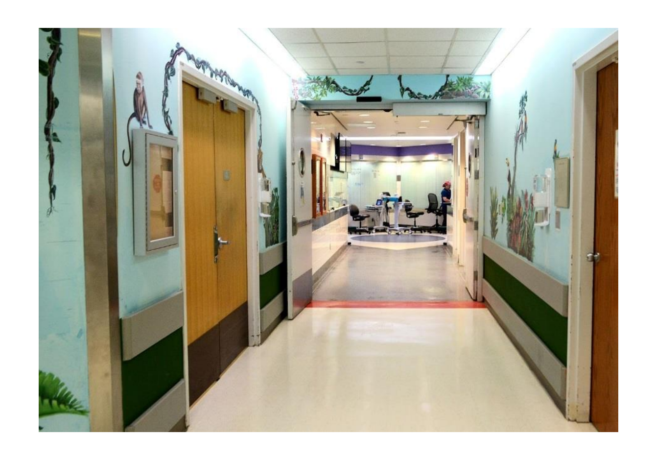
My surgery room is behind these doors.