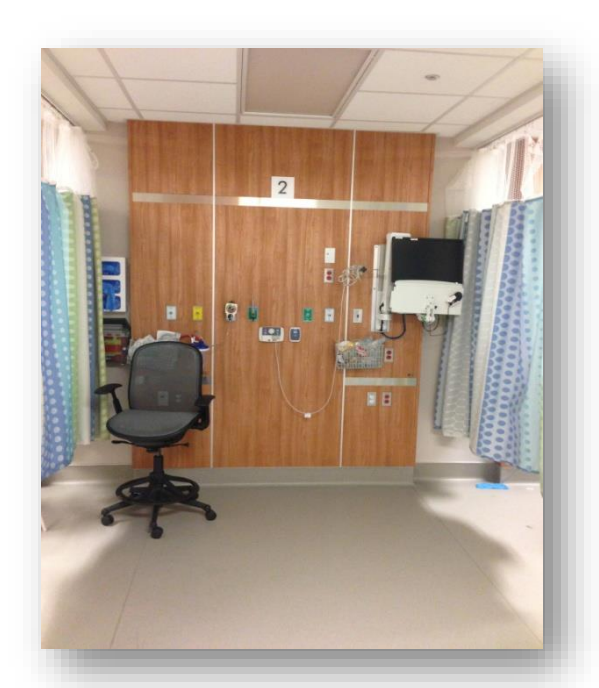
This is the holding room.

My family can wait with me in the holding room.