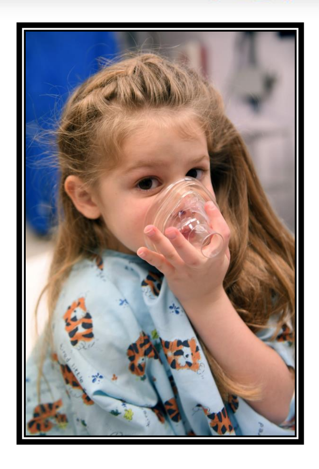
I can practice breathing in my mask if I want.