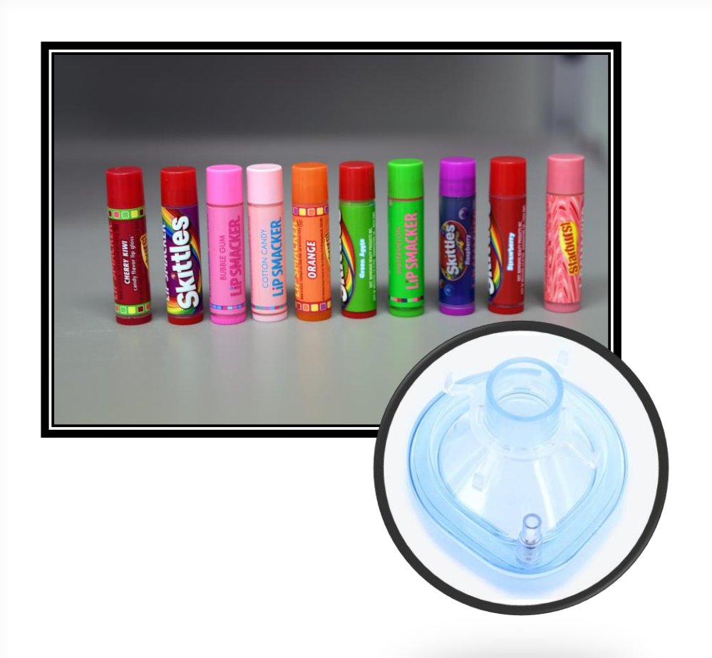
While I am waiting I can pick a flavor to smell for my mask.