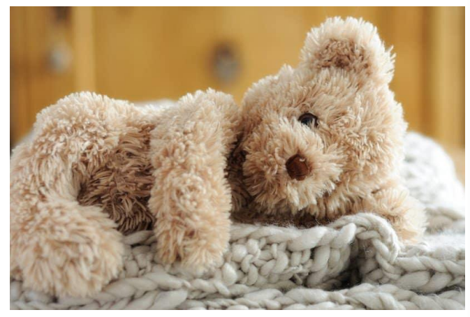
I will lay on the bed.

My family and I will go to a room with a TV.