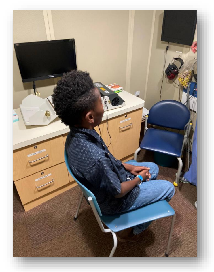
Last, is my hearing test.

My family and I will walk to a different room for my hearing test.