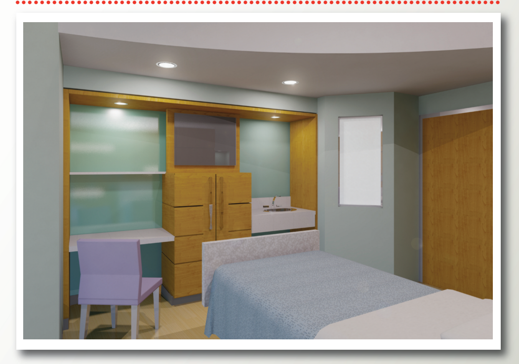
Rendering above is of a typical patient room. Directly below is a nurses' station and, at bottom, is a view of "Main Street," where many family/patient resources will be located.