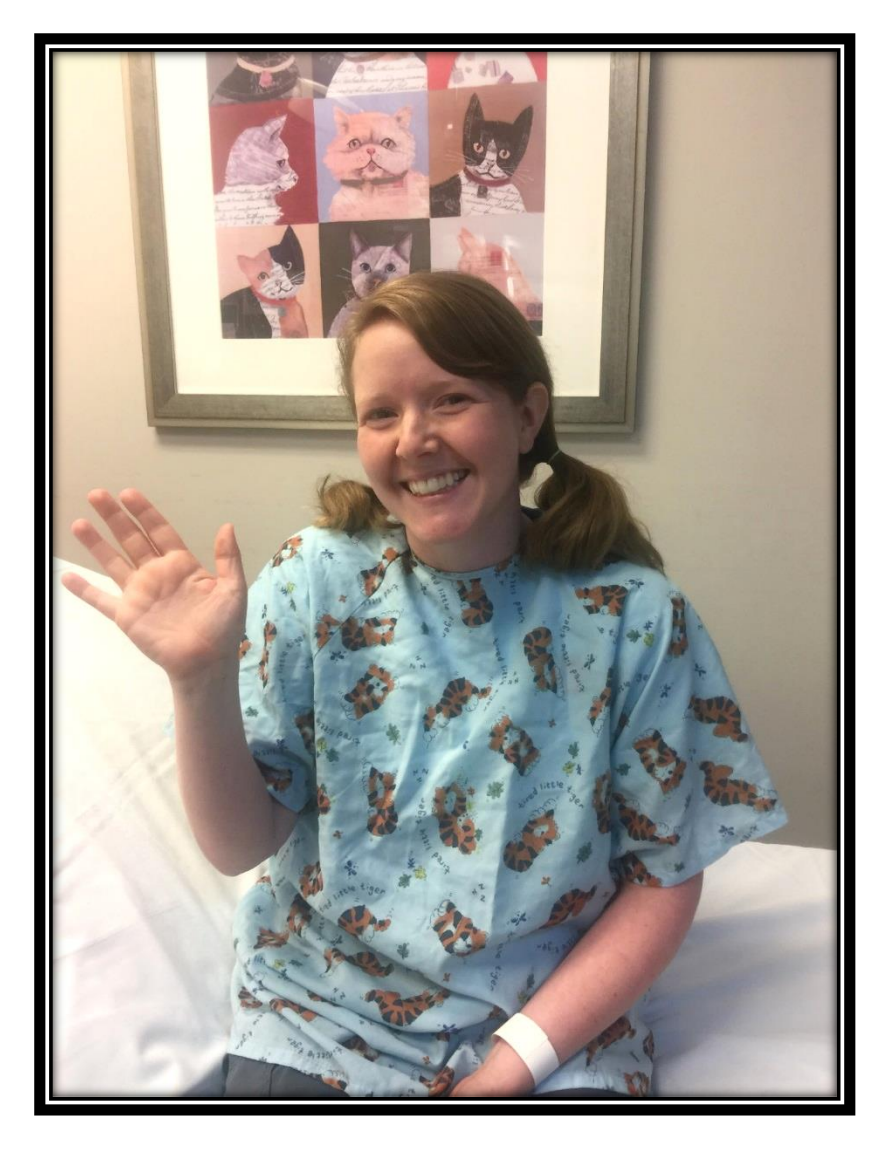
I am getting an insulin shot.

Insulin helps my blood sugar from getting too high. If my blood sugar gets too high my body may start to feel bad and get sick.