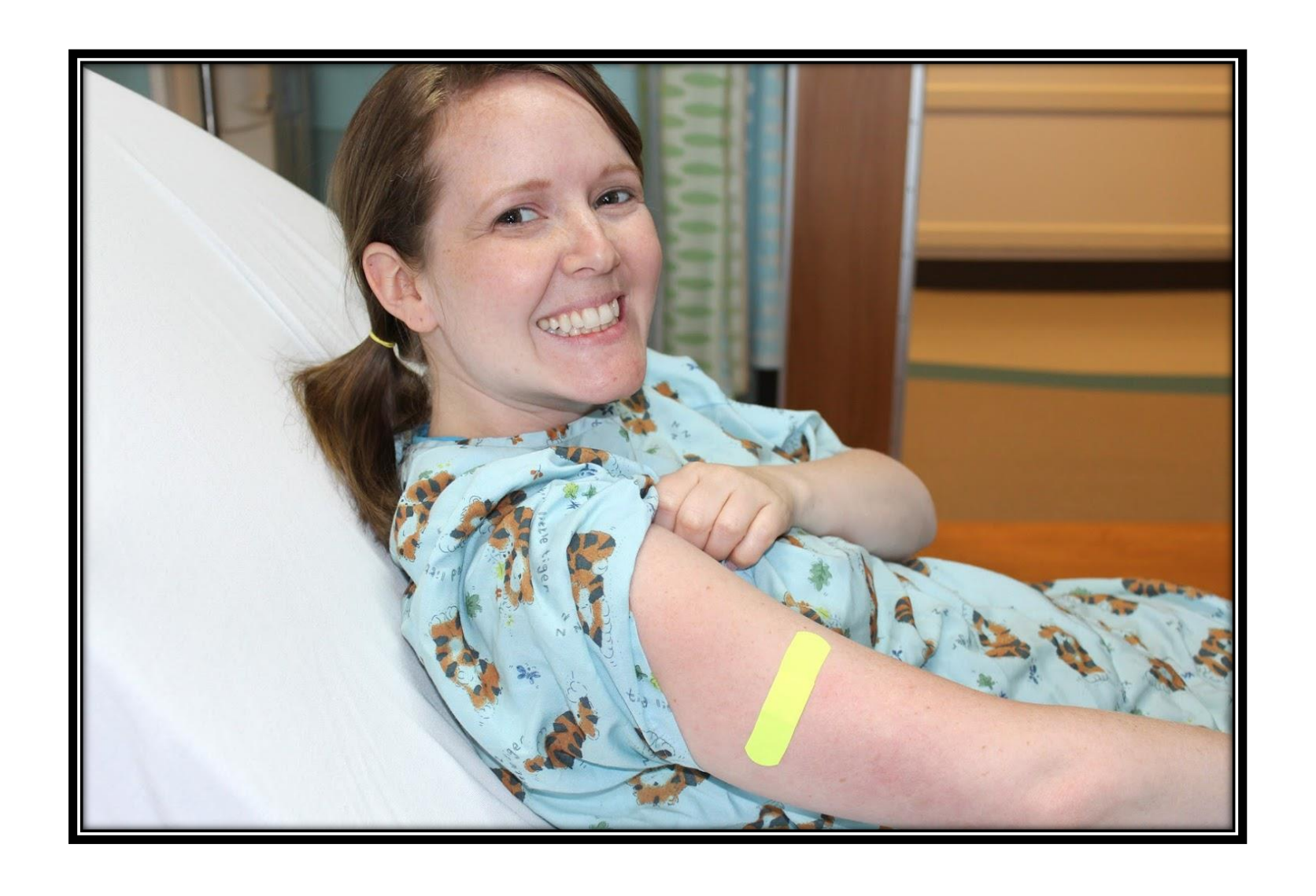
Now my shot is done and I can choose a band aid if I want!