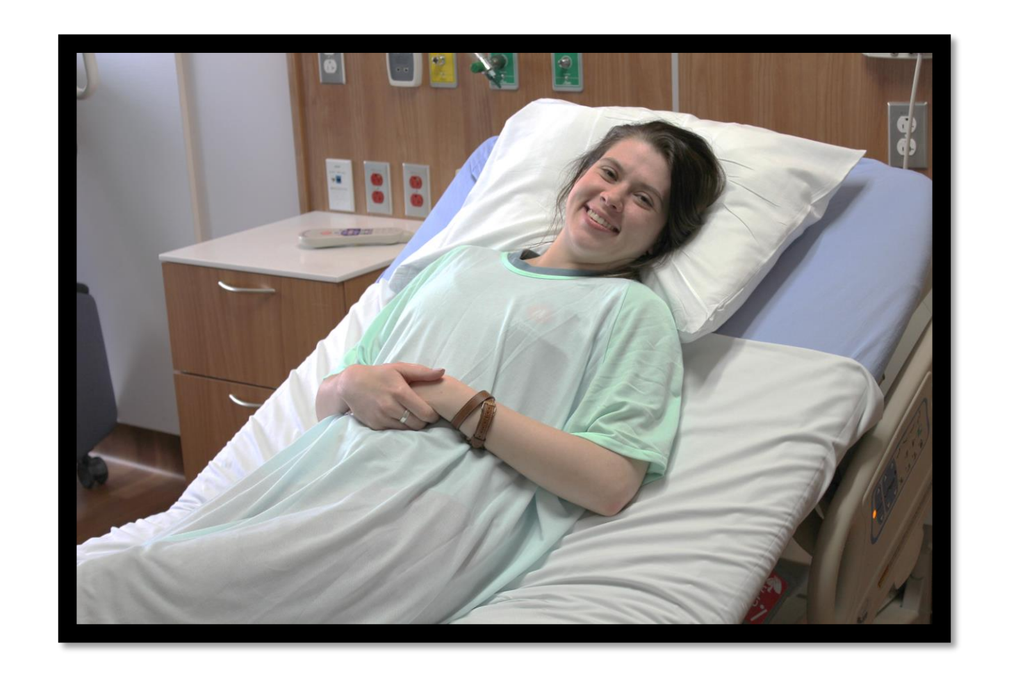
I am going to get a foley.

A foley is a bendy tube that will help remove urine, or my pee, from my body.